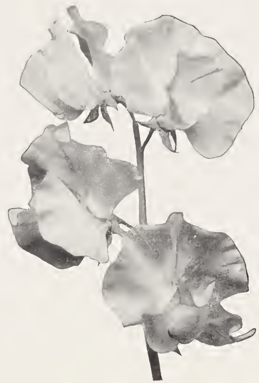
Giant Rose—1/3 Natural Size